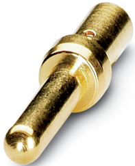
Crimp contact, turned, contact diameter: 2 mm, crimp range: 1.5 mm 2 ... 2.5 mm 2

Please be informed that the data shown in this PDF Document is generated from our Online Catalog. Please find the complete data in the user's documentation. Our General Terms of Use for Downloads are valid ( http://phoenixcontact.com/download )